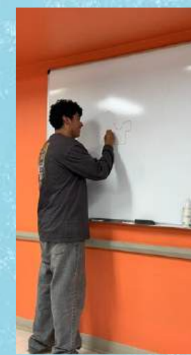
learned through games