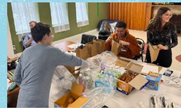
Assembled Mana bags